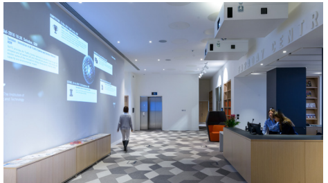
Faraday video wall & members' reception area